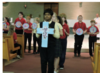
Children praying a Living World Mission Rosary at the Sacred Heart School in Ventura, CA, in the Archdiocese of Los Angeles and Saint Joseph Catholic School in Libertyville, IL in the Diocese of Belleville